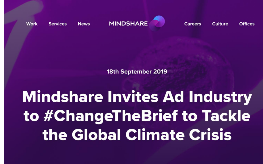
#ChangeTheBrief September 2019