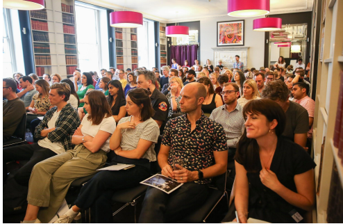
Climate Crisis Summits June 2019 - Feb 2020