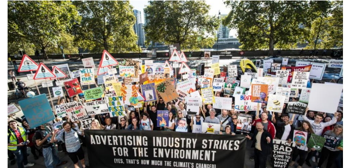
Create & Strike September- October 2019